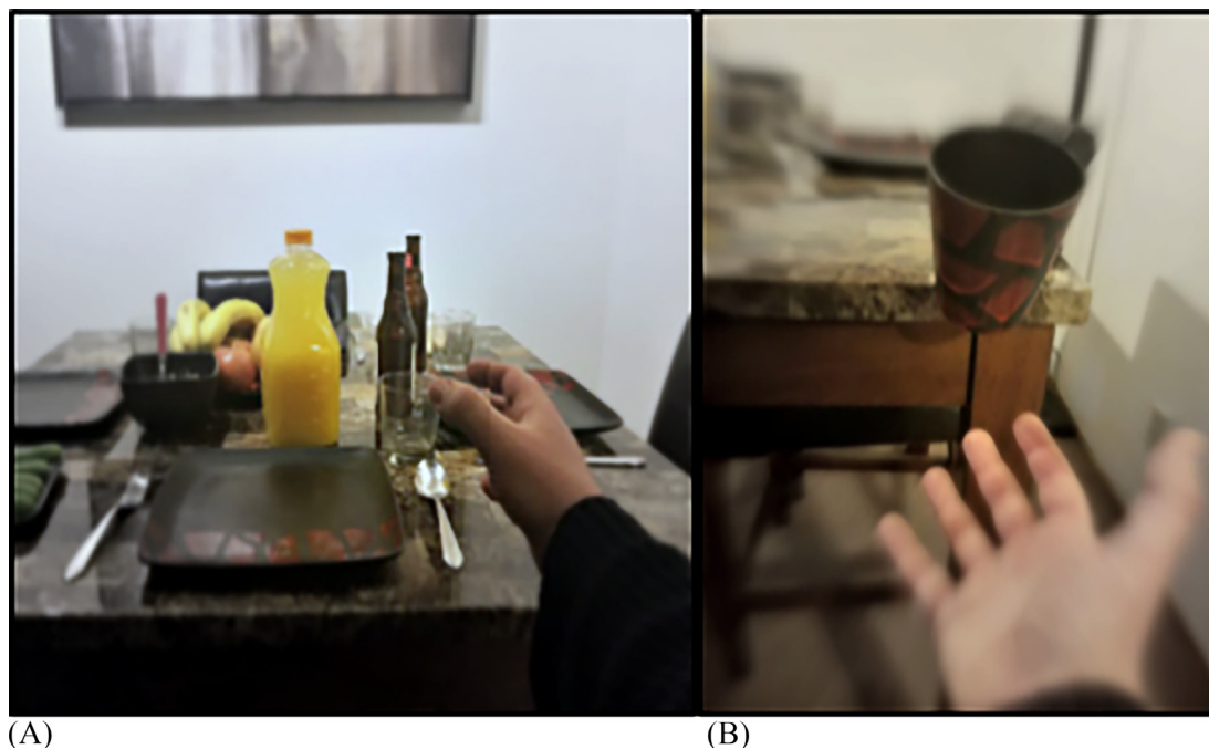
Fig. 1. The Dorsal Stream in Action. (A). Consider the challenges of performing a simple visuomotor task, such as pouring orange juice from a bottle on the table, into a glass. The observer must determine the location, distance, and size of the object relative to himself. Initiating a reach towards the object involves constant monitoring and updating of hand position to avoid knocking over other objects (i.e., obstacles) that may be in the way. He must also determine the 3-D geometric structure of the object, so that the fingers can be shaped appropriately to match the anticipated contact site. To do pour contents from (rather than simply move) the bottle effectively, he needs to apply a grip force that is commensurate with the object's shape and weight. This weight estimate presumably requires information about the object's size and material properties – information that needs to be recalibrated on-the-fly, given that the object's weight will change as liquid moves from the bottle to the glass. (B). These computations become even more complex when the objects we wish to interact with are in motion. For example, we may notice a cup falling from the table, and instinctively reach to grasp it. This action requires many of the dynamic computations described above (i.e., reaching in the right direction and adjusting the fingers to match the object's shape), but now they must be applied to an object whose spatial position and distance from the observer are changing rapidly. Both 3-D structure, and form-motion integration, are required to interact with objects in dynamic real-world contexts. (For interpretation of the references to colour in this figure legend, the reader is referred to the web version of this article.)

properties are processed in the dorsal pathway, some have argued that dorsal cortex is critically involved in processing 3-D geometric shape information, such as surface curvature, size, and location relative to the observer (Farivar, 2009; Freud et al., 2016; Janssen, Verhoef, & Premereur, 2018; Orban, 2011). A separate branch of research has focused on the involvement of dorsal cortex in motion processing and form-motion interactions (Galletti & Fattori, 2018; McCarthy, Erlikhman, & Caplovitz, 2017). In the sections below, we relate research outcomes in 3-D shape representation and form-motion integration in dorsal cortex, with respect to their contribution to action-related object processing. We also revisit the ways in which dorsal object processes differ in fundamental ways from the known properties of object areas along the ventral processing stream (DeYoe & Essen, 1988; Goodale & Milner, 1992). A synthesis of recent research in each of these domains will foster a more complete understanding of the nature of object processing in the dorsal visual stream, and serve as a guide to future research in the field.